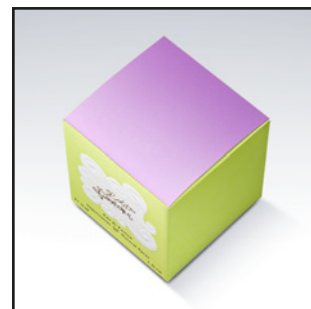
Angle: 60° Overhead Viewpoint: Side