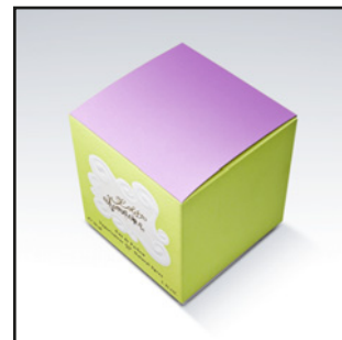
Angle: 30° Overhead Viewpoint: Side