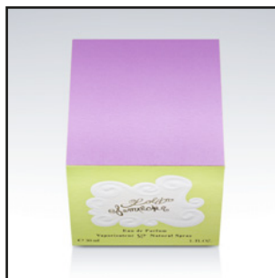
Angle: 60° Overhead Viewpoint: Front