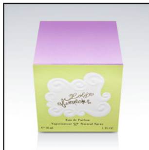
Angle: 30° Overhead Viewpoint: Front