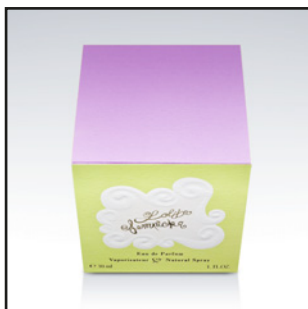
Angle: 45° Overhead Viewpoint: Front