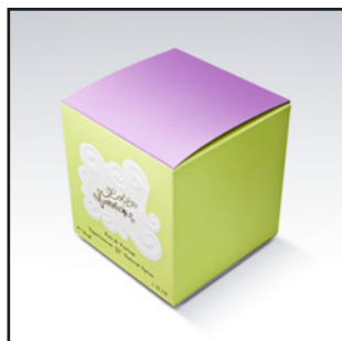
Angle: 45° Overhead Viewpoint: Side