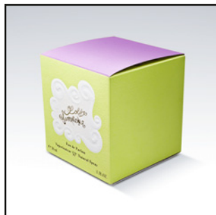
Angle: 15° Overhead Viewpoint: Side