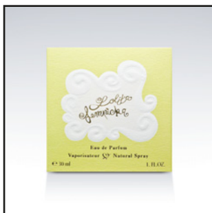
Angle: Camera Level Viewpoint: Front