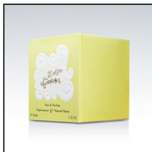
Angle: Camera Level Viewpoint: Side