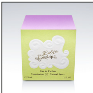
Angle: 15° Overhead Viewpoint: Front